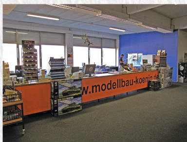
Our "office" and counter in the store

We hired two more people for the warehouse and shipping (Fakrim is still our main worker at the packing table today), and we were ready to go. Now, with an expanded product range and a lot of work every day, the number of items we offered online quickly grew to 20,000.