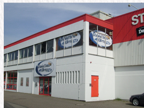
The store in 2008 from the outside