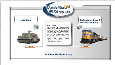
2006 the startpage transformed to a basic decision page ...

This marked the beginning of the heyday of Dragon and Trumpeter, who gave the established brands a run for their money with affordable kits and a wealth of content.