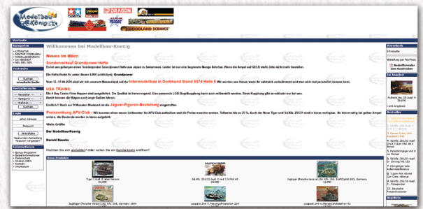
A screenshot from 2005 – the shop featured kit modelling AND trains

At that time, none of the established wholesalers supplied purely online shops or internet retailers. The general consensus was: "This internet thing will be gone soon." So we imported the kits by air freight directly from the USA. Most new releases were available there earlier, since transport times between Asia and the US West Coast were only about two weeks, whereas ships to Europe usually took five or six weeks. Therefore, we were often the first to be able to offer new kits back then.